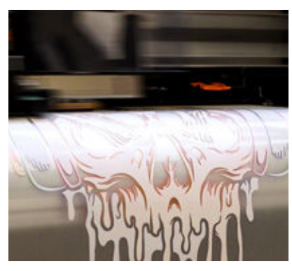
QUICK DRYING Quick-drying times with Kodak, Mimaki, DuPont, Epson, STS & more DTF inks vibrant results, no waiting.