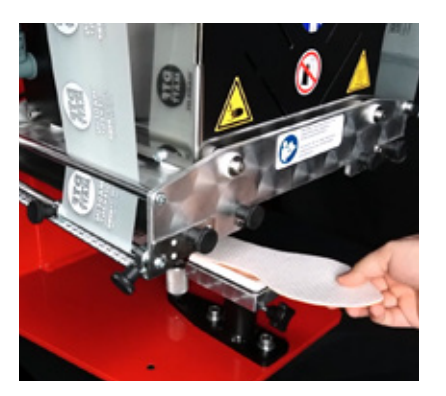
MASS PRODUCTION DTF mass production with 1-second transfers & instant peel. Cut costs & boost efficiency.