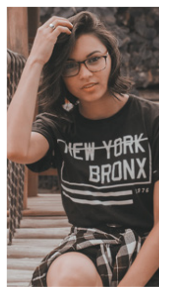
GLITTER OR MATT FINISH