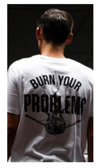
LIGHT & DARK TEXTILES